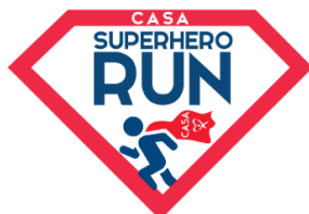
Race and Walk June 18, 2022